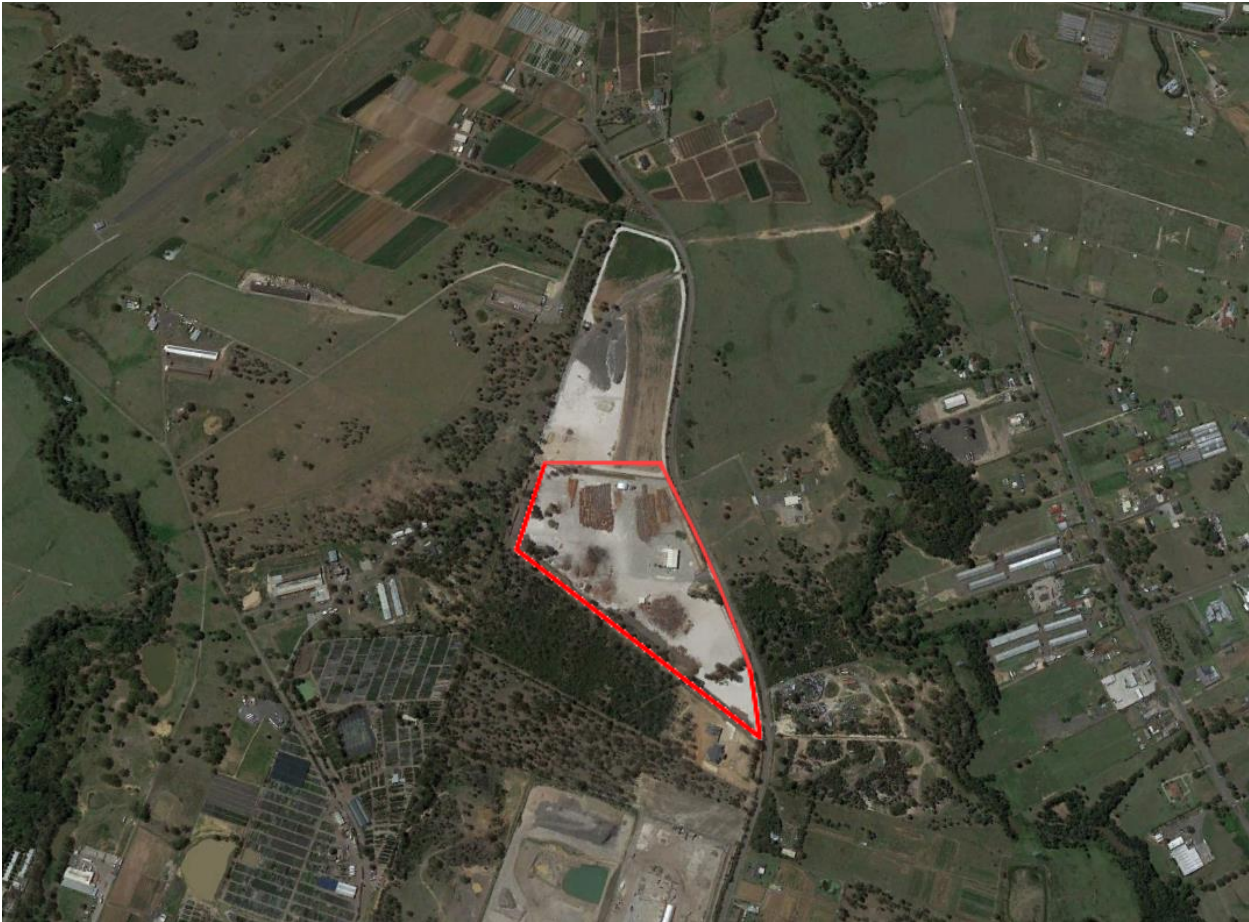
Figure 2 Aerial photograph of the TreeServe site

It is acknowledged that critical infrastructure may be required to support the Aerotropolis in the longer term. However, this critical infrastructure must be properly coordinated, and mechanisms must be established to clearly provide certainty for existing landowners and facility operators so that existing business activities are not unduly constrained or restrained in the short and medium terms.