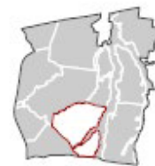
Figure 3: Structure Plan – Aerotropolis Core