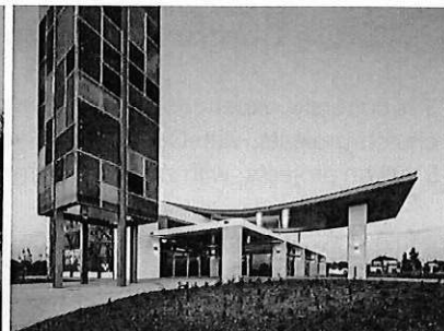
New Life, Oran Park