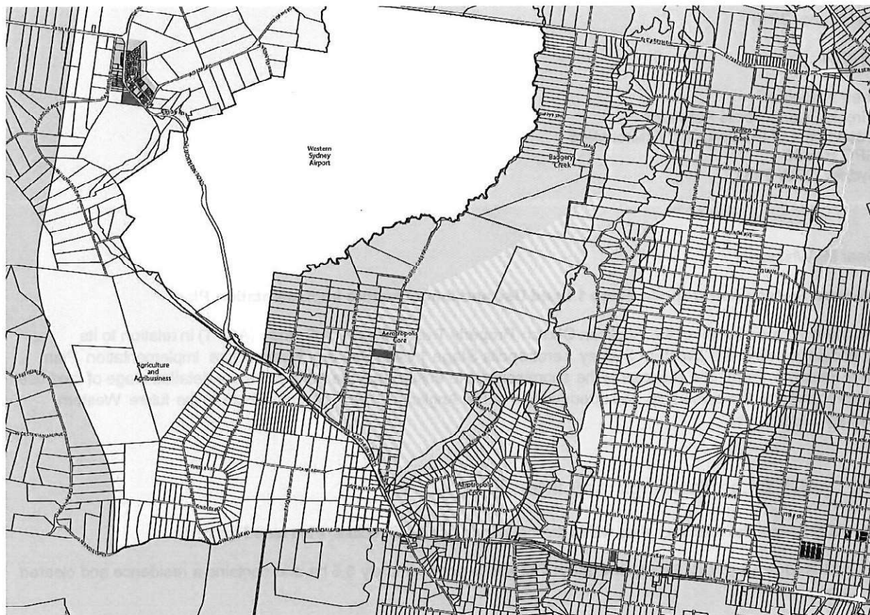
Figure 1 The Plan with ACPT land shown in red