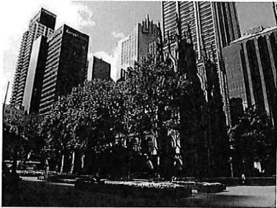
St Andrews, Sydney

ACPT's ownership in the Rossmore and Aerotropolis Core precincts allows for place-based planning to occur up front around this social and cultural infrastructure to ensure that the objective of providing great places, where people have an identity and connection with their community is achieved.