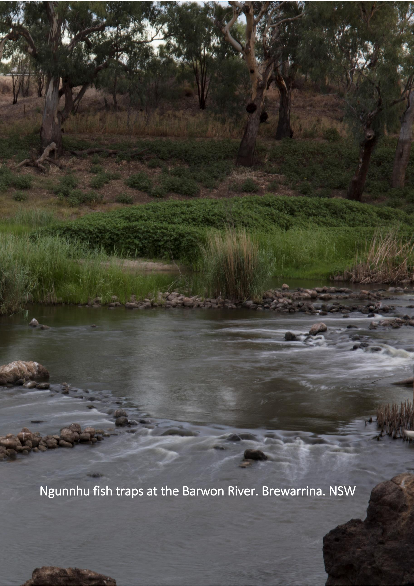
Ngunnhu fish traps at the Barwon River. Brewarrina. NSW