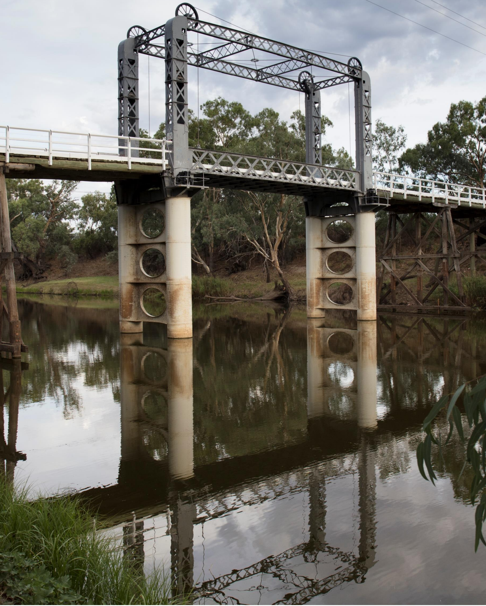
Old bridge over Barwon River. Brewarrina, NSW.