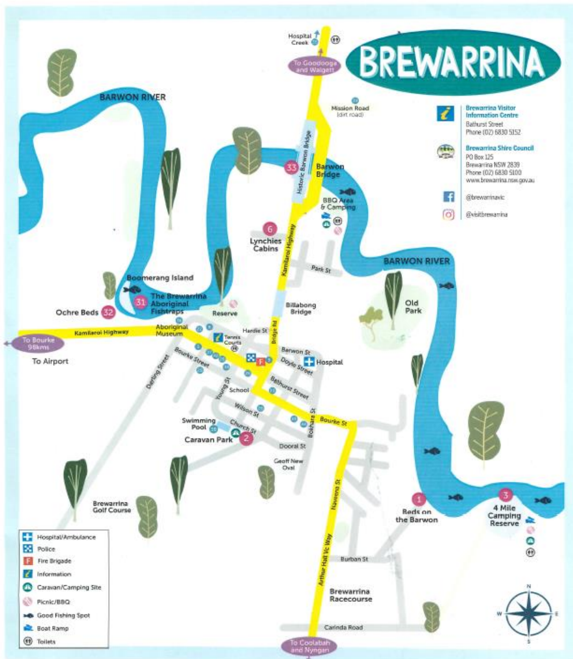
Figure 2: Brewarrina