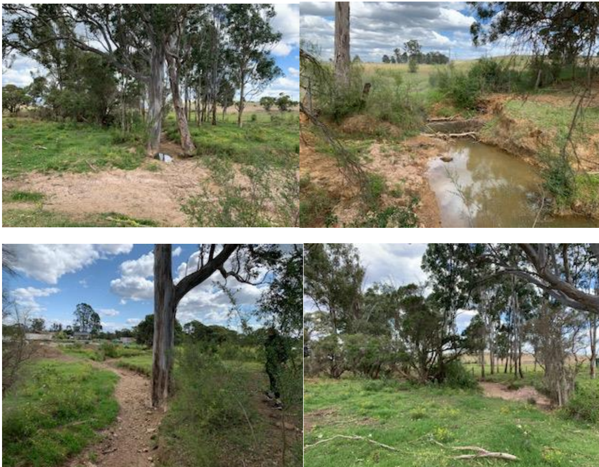
Current tributary line

The uncontrolled runoff has now created excessive sediment, erosion and gullying of the tributary line which has resulted in a number of trees collapsing or being washed away and this is shown in the photographs below.