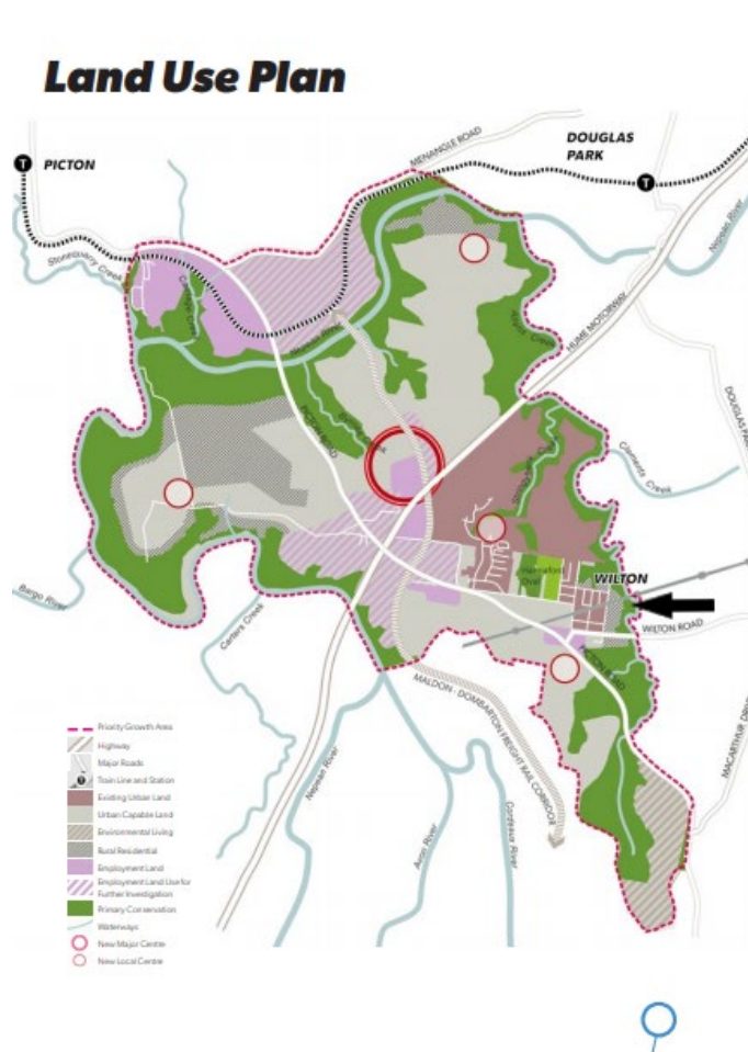
Wilton2040 land use map shows Rural Residential area on eastern side of Peel Street, Wilton.