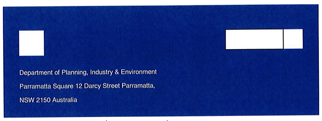
Contact Us | Privacy Statement | Unsubscribe from all emails www.planning.nsw.gov.au

You can view the Plan documents and <u>make a submission</u> here.