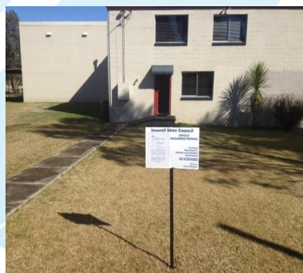
Photo 1 – Example of advertised Development Application sign at the site of the proposed development

The EP&A Act 1979 and other State Environmental Planning Policies may specify circumstances where certain applications require advertisement. In certain circumstances, Council may choose to advertise a development not listed above if it is considered necessary on the basis that it is in the public interest.