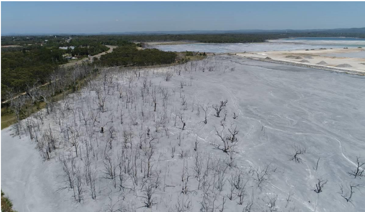
Vales Point Coal-ash dam.

It is obvious that the department has not taken into consideration the long term legacy of Power Stations and mining in the region, having close to fifty million tonnes of toxic Coal-ash being stored opposite proposed housing developments at Doyalson.