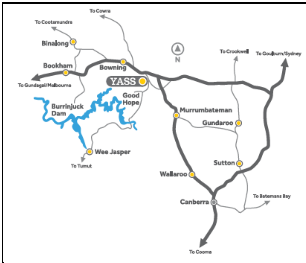
Figure 1: Yass Valley and its' regional connections

our proximity to Canberra, and location between Sydney and Melbourne. Visitors are attracted to the area to enjoy the food and wine, heritage, arts and culture of the region.