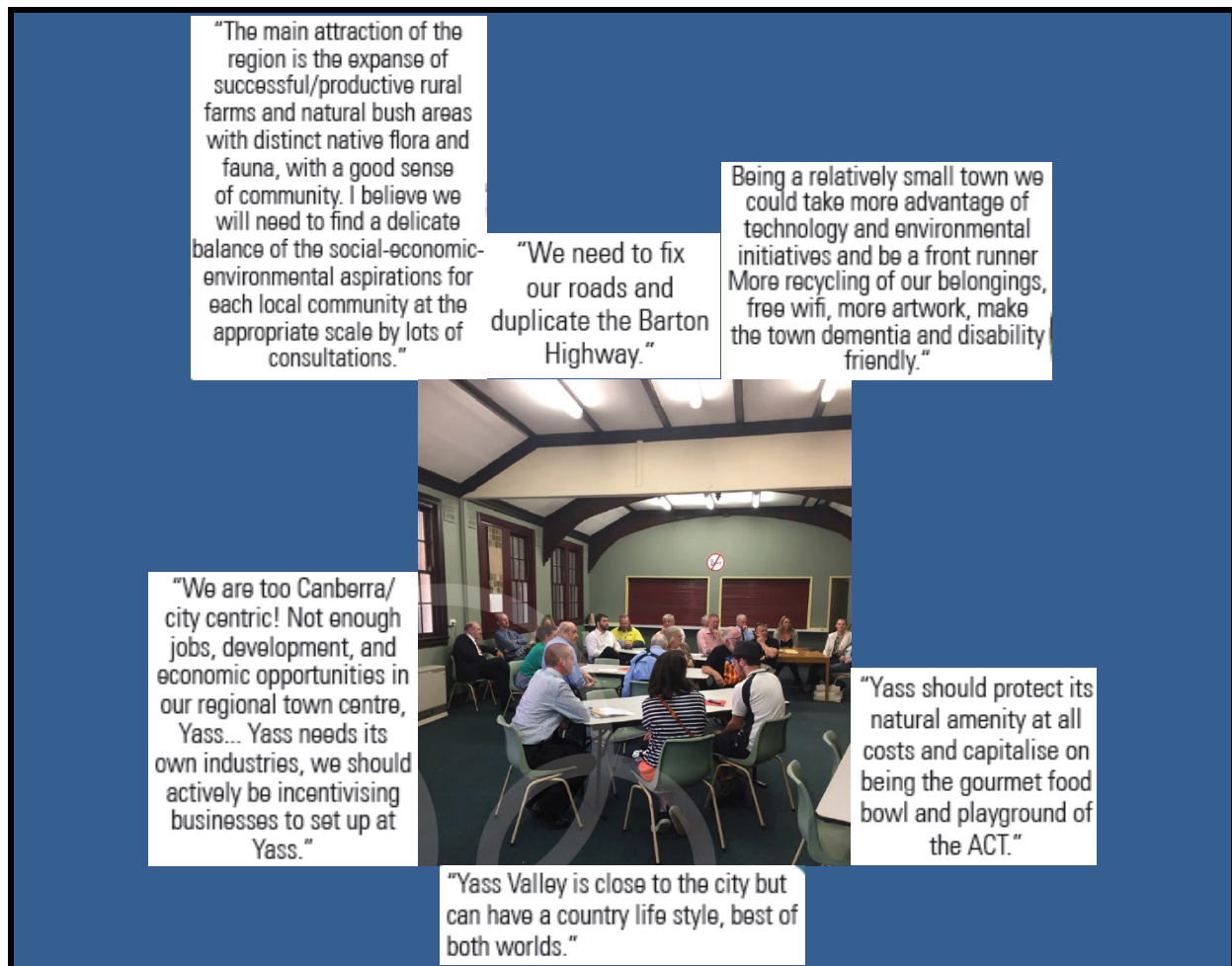
Figure 2: Community Consultation for the Tablelands Regional Community Strategic Plan

Council prepared this statement by referring to the community consultation undertaken in 2016 through The Tablelands Regional Community Strategic Plan and community and public agency consultation on the Yass Valley Settlement Strategy 2036 during 2017.