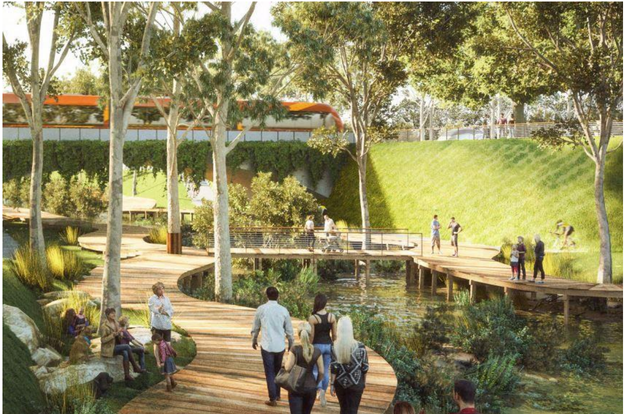
An illustration of a proposed parkland area near the airport.

It said design proposals for the greater region, known as the Western Parkland City clashed with air safety if left without mitigation strategies.